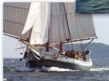
The Grace Bailey