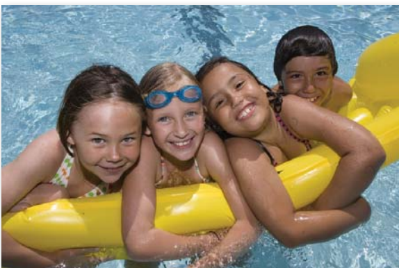
Lake Arrowhead Swimmers enjoying the Junior Olympic Pool at the LA Chapel's recent Summer Family Kick Off Carnival held at Great Festival Park on May 30.

The Highlands Course will be closed Monday, July 6, for greens aerification